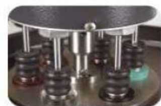
Individual Force Application