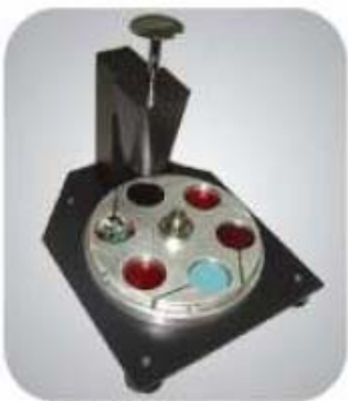
Levomat Specimen Loading Fixture to level specimens for central force specimen holders.