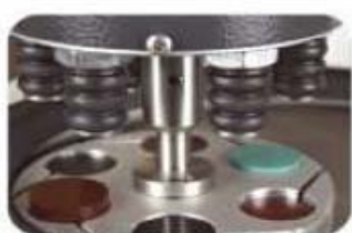
Central Force Application