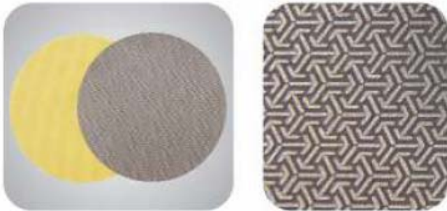
With MAGNETO discs, each grinding step is 1 minute. Total preparation time amounts to 7 minutes.

The Automatic Head is mounted to a hardened steel post which is affixed to the cast base of the grinder/polisher. The force on the specimen, "individual" or "central", is pneumatically controlled by a pressure transducer. The system is enclosed in a GRP housing with touch - pad front panel. The Automatic Head is rapidly positioned via a quick-locking clamping lever. The "soft start and stop" feature automatically starts the sequence with a low initial force which is then increased to the preset. Towards the end of the cycle the force is automatically reduced to 75% of the setting to prevent scratching. A variety of sample holders for individual or central force applications are available for different sample sizes.