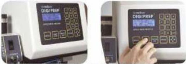
DIGIPREP 300 with DOSIMAT Peristaltic Dispenser (Top) Front Panel with LCD display (Above)