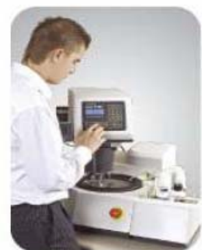
DIGIPREP 250 Preparation system