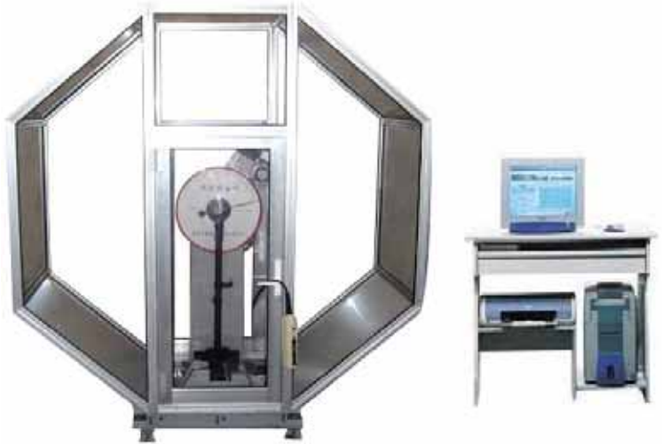
ITC-500 shown with optional safety cover.