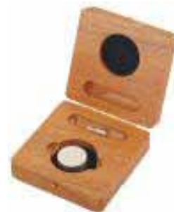
Vickers Test Bloc